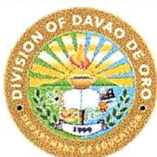
CRISTY C. EPE Schools Division Superintendent

Address: Capitol Complex, Brgy. Cabidanan, Nabunturan, Davao de Oro Contact No. 0951-387-1728 (TNT); 0915-399-7779 (Globe) Email Address: davaodeoro@deped.gov.ph Website: www.depeddavaodeoro.ph