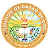
CRISTY C. EPE Schools Division Superintendent

Address: Capitol Complex, Brgy. Cabidanan, Nabunturan, Davao de Oro Contact No. 0951-387-1728 (TNT); 0915-399-7779 (Globe) Email Address: davaodeoro@deped.gov.ph Website: www.depeddavaodeoro.ph