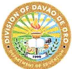
CRISTY C. EPE Schools Division Superintendent

Address: Capitol Complex, Brgy. Cabidanan, Nabunturan, Davao de Oro Contact No. 0951-387-1728 (TNT); 0915-399-7779 (Globe) Email Address: davaodeoro@deped.gov.ph Website: www.depeddavaodeoro.ph