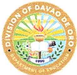
CRISTY C. EPE Schools Division Superintendent

Address: Capitol Complex, Brgy. Cabidanan, Nabunturan, Davao de Oro Contact No. 0951-387-1728 (TNT); 0915-399-7779 (Globe) Email Address: davaodeoro@deped.gov.ph Website: www.depeddavaodeoro.ph