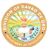
CRISTY C. EPE Schools Division Superintendent

Address: Capitol Complex, Brgy. Cabidanan, Nabunturan, Davao de Oro Contact No. 0951-387-1728 (TNT); 0915-399-7779 (Globe) Email Address: davaodeoro@deped.gov.ph Website: www.depeddavaodeoro.ph