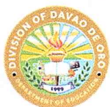
CRISTY C. EPE Schools Division Superintendent

Address: Capitol Complex, Brgy. Cabidanan, Nabunturan, Davao de Oro Contact No. 0951-387-1728 (TNT); 0915-399-7779 (Globe) Email Address: davaodeoro@deped.gov.ph Website: www.depeddavaodeoro.ph