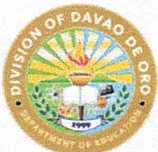
CRISTY C. EPE Schools Division Superintendent je

Address: Capitol Complex, Brgy. Cabidanan, Nabunturan, Davao de Oro Contact No. 0951-387-1728 (TNT); 0915-399-7779 (Globe) Email Address: davaodeoro@deped.gov.ph Website: www.depeddavaodeoro.ph